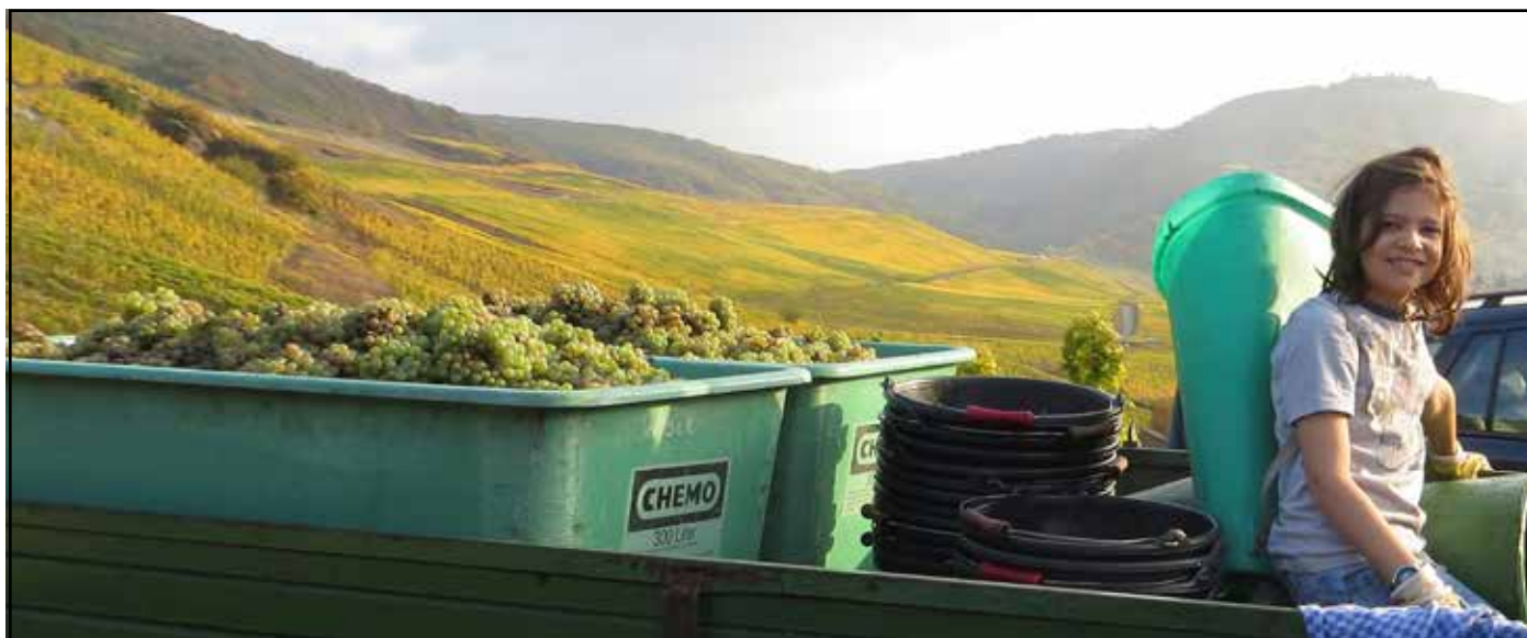
2016 Mosel Riesling harvest at Willi Schaefer